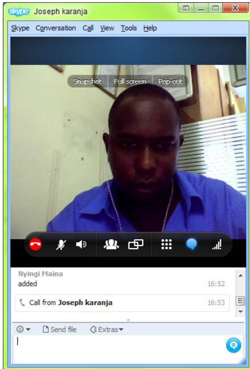
Video call on Skype