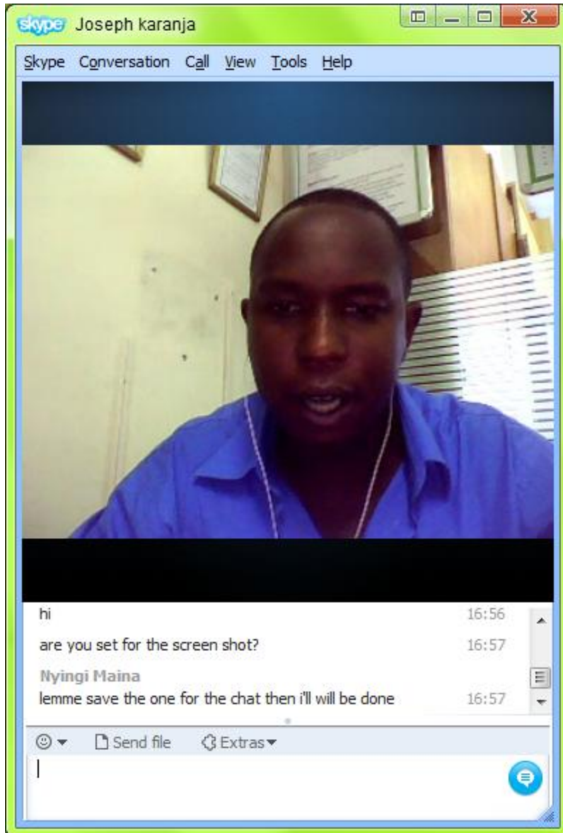
Video call and instant message chat